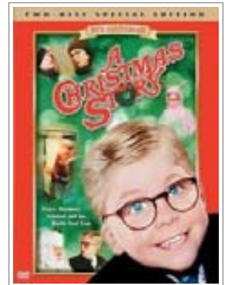
A Christmas Story DVD cover

Each time an adult dismisses Ralphie's Red Ryder as foolish or dangerous, his spirits droop. But in short order, his desire overwhelms despair and hope returns. Regardless of what others may say, Ralphie is undeterred. It doesn't matter how many times he hears "you'll shoot your eye out;" Ralphie wants a Red Ryder.