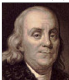
Ben Franklin would list the “pros” and “cons” to compare choices.

Life Insurance Cash Values. Pros: High degree of safety, stability and liquidity over the long term. Whole life insurance contracts declare a minimum guaranteed